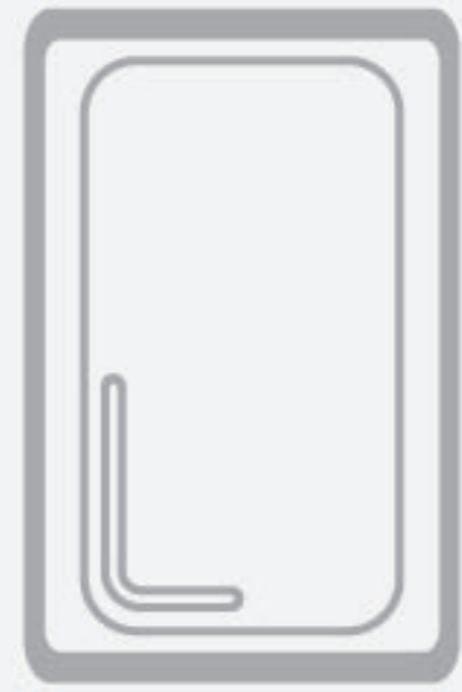
4.3inch Touch Screen

Fully upgraded high performance 3D Printer